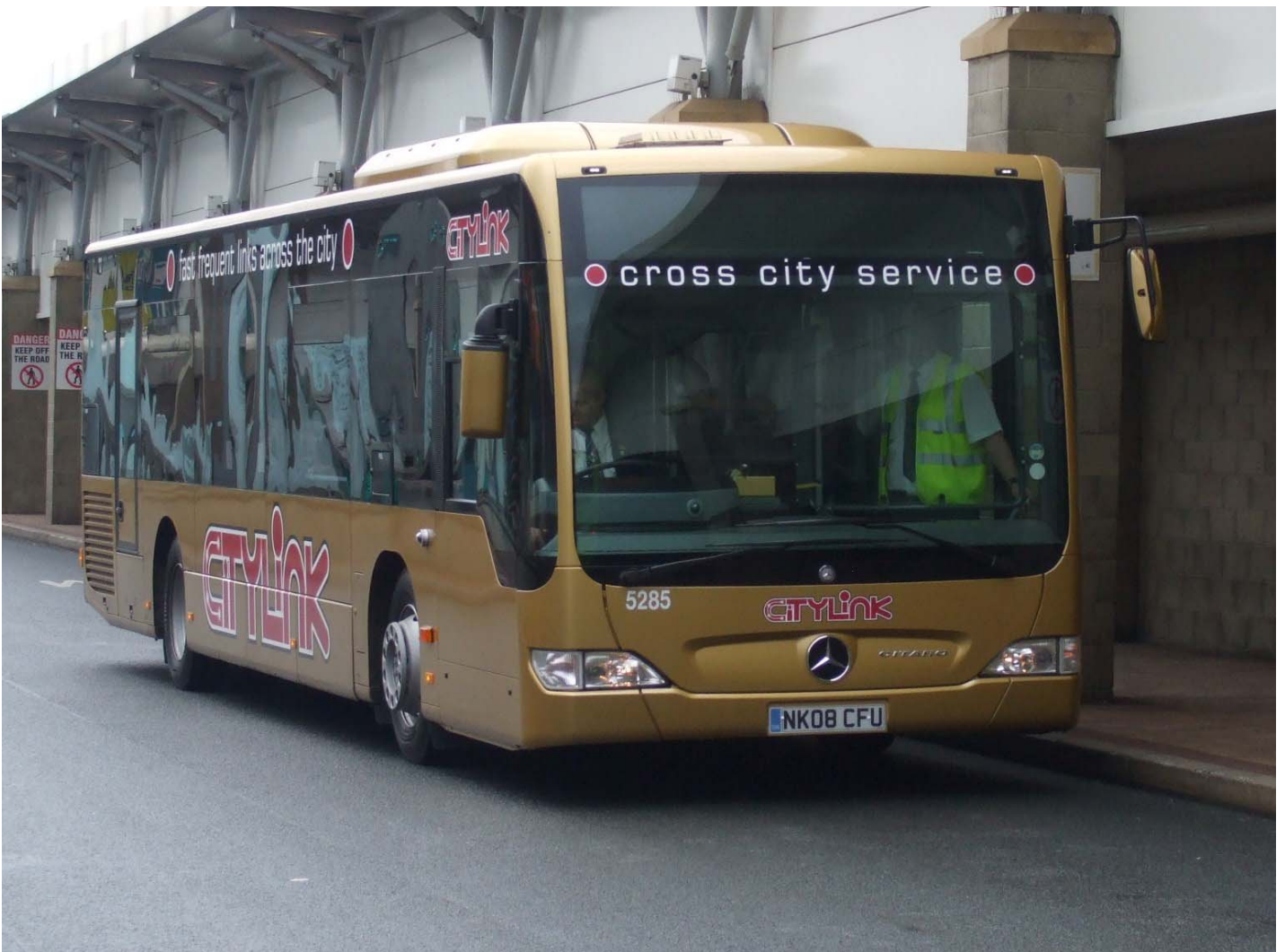
A brand new Citaro of Go North East 5285 (NK08CFU) which entered service on March 30 th complete with its new Citylink branding

From Chell climb hill past derelict pub (The Matador), turn left by traffic lights into unnamed road, Bakers are visible from A527 and many buses are visible from public land across swampy field